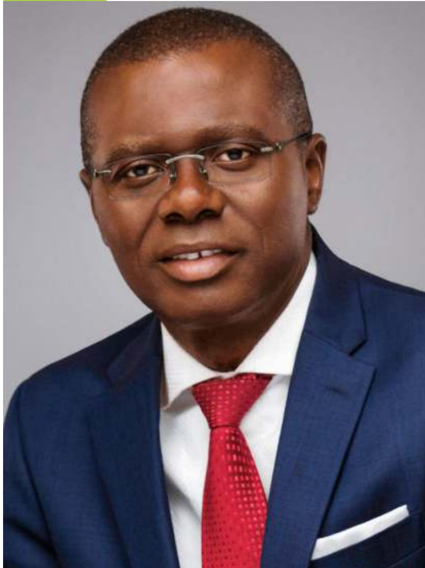
HIS EXCELLENCY Babajide Olusola Sanwo-Olu Executive Governor, Lagos State.