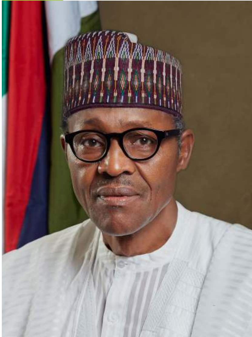
HIS EXCELLENCY Muhammadu Buhari , GCFR President of the Federal Republic of Nigeria